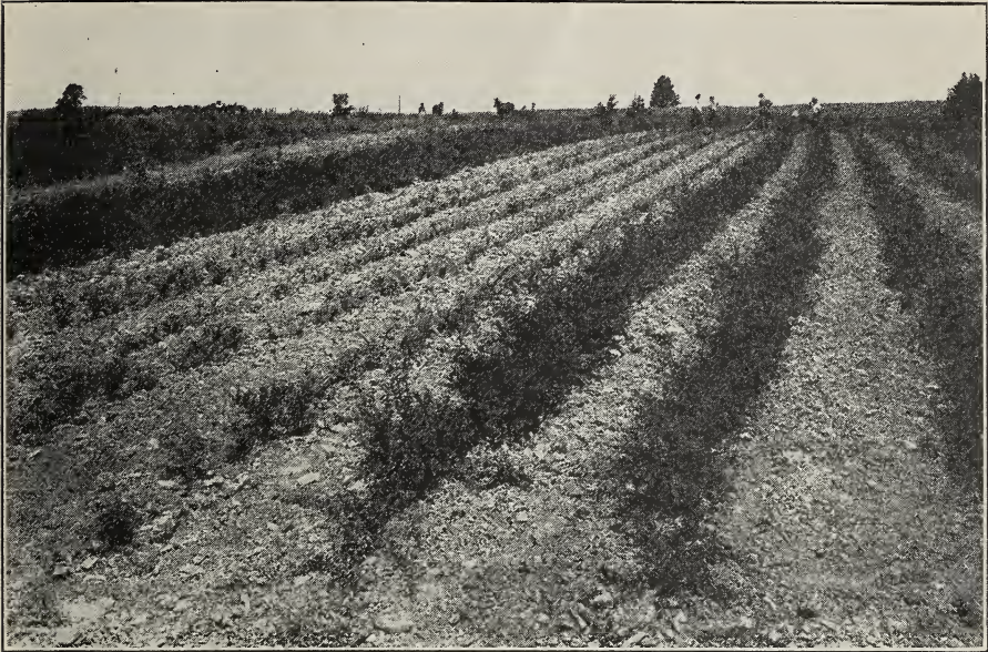
This shows one of our several blocks of one and two year transplanted Barberry Thunbergi, consisting of about 20,000 nice bushy plants. Photographed July 10, 1924.